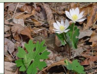
Sanguinaria canadensis , Bloodroot